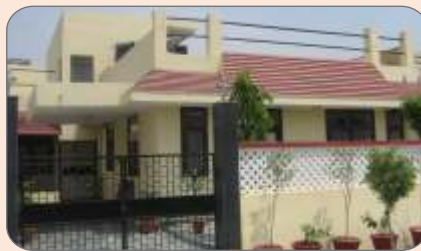
Raksha Enclave, Omega-2, Greater Noida Rs. 28 Lacs in 2006