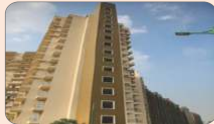
Raksha Towers, Eco Village, Sec 1, Noida Extn Rs. 1800/- per sq ft in 2010