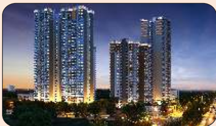
Raksha Towers, MI Casa, Sec 68, Gurgaon Sold Out (Construction Commencing Shortly)