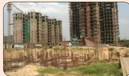
Raksha Towers, Vihaan Greens, Sec 1, Gr. Noida (W) Sold Out (Under Construction)

AFOWO - Proudly Serving Guardians of the Nation