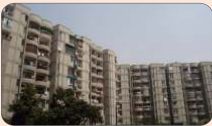
AFNOE, Dwarka, New Delhi Rs. 8.20 Lacs in 1998