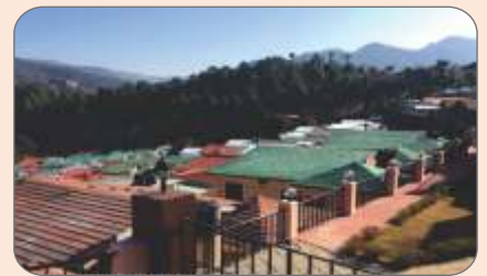
Raksha Retreat Villas - Bhimtal, Nainital Rs. 12.5 Lacs in 2009