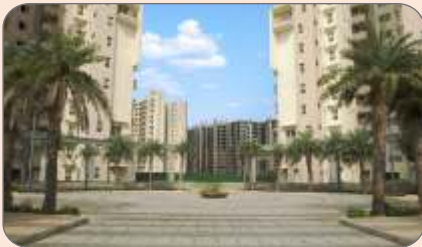
Raksha Towers, Park Serene, Sec 37-D, Gurgaon Rs. 1900/- per sq ft in 2010